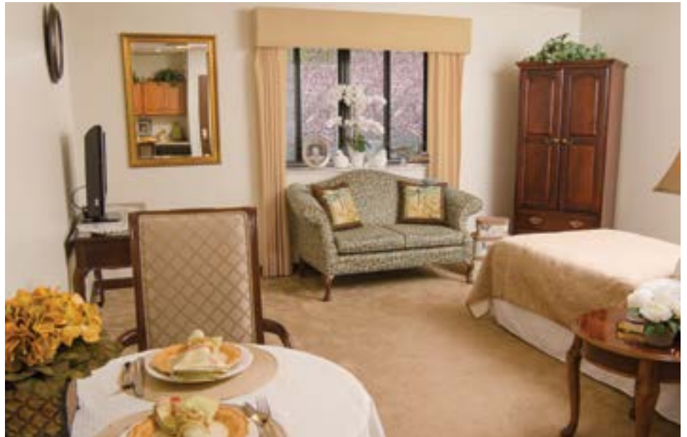
A private assisted living suite at Lincoln Park Manor

Private Assisted Living suites offer ample space to include your own furnishings. Two floor plans are available: one includes a small kitchenette area that has a mini-refrigerator, cupboard space and small sink or you can select a room that has a custom built-in closet. Every room also features a private bathroom with walk-in shower.