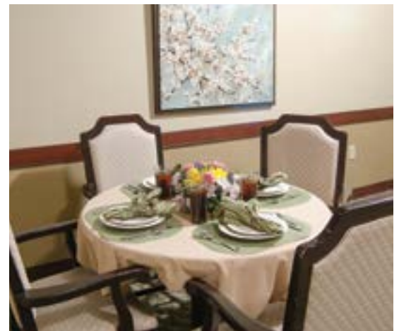
Assisted living dining room