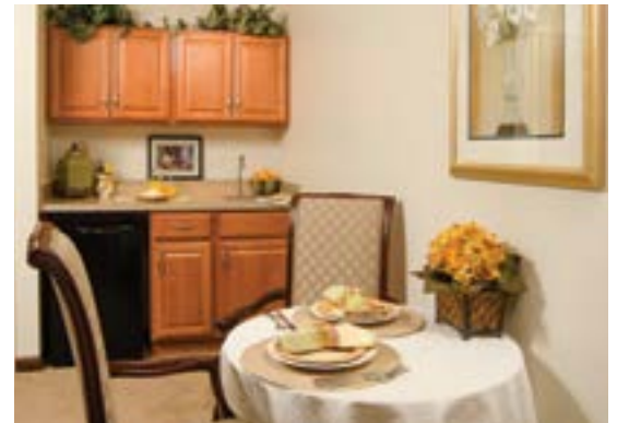
Assisted living suite kitchenette and dining areas