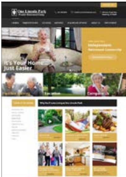
One Lincoln Park’s new home page

There are several resources you can download to assist in your search for a retirement community or skilled nursing center. One Lincoln Park’s most popular floor plans, and Lincoln Park Manor’s assisted living and skilled nursing rooms are shown with beautiful new photography. Learn more and ask questions with LIVE CHAT, which will be available Monday-Friday from 9am-4pm.